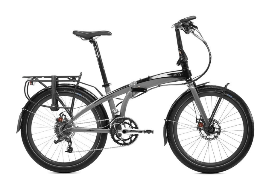
The Tern Eclipse $18