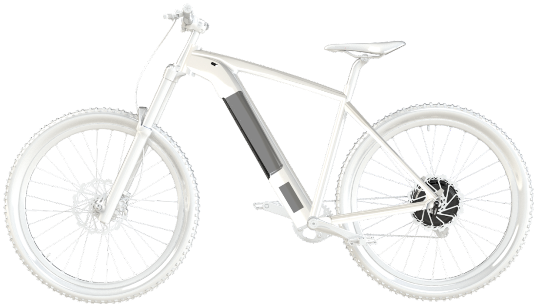
Size visualization of hub motor in a 29" wheel, using the latest Bafang F-series integrated downtube battery

The super-silent operation of this hub motor is particularly impressive, thanks to a specially-designed gear reduction system. It will be available from Q1-2018 on.